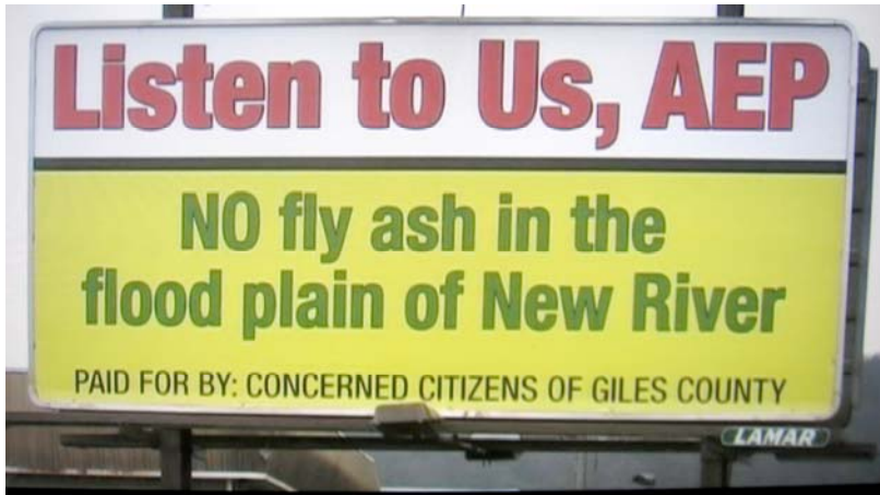
Clean coal opponents' billboard in Virginia

http://www.appvoices.org/index.php?/site/voice_stories/assessing_the_cost_of%20wise_county_coal_plant